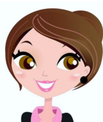
B&D MFG INC. Geo Girl

B&D in-house fabricates custom insulated PVC manifolds as well as HDPE manifolds for your indoor headers. PVC manifolds are sold in pairs and are available in multiple sizes.