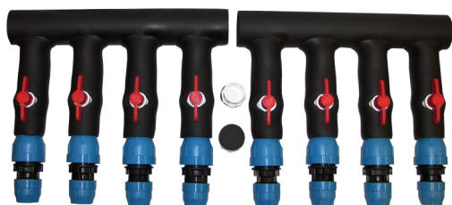
Insulated PVC Manifold

For more information refer to page 64 of Volume 7 B&D product catalog or contact sales@bdmfginc.com for more information and configurations.